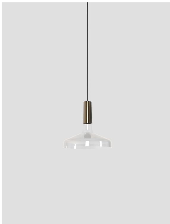
SCINT SP G CRTR BH L22 CE